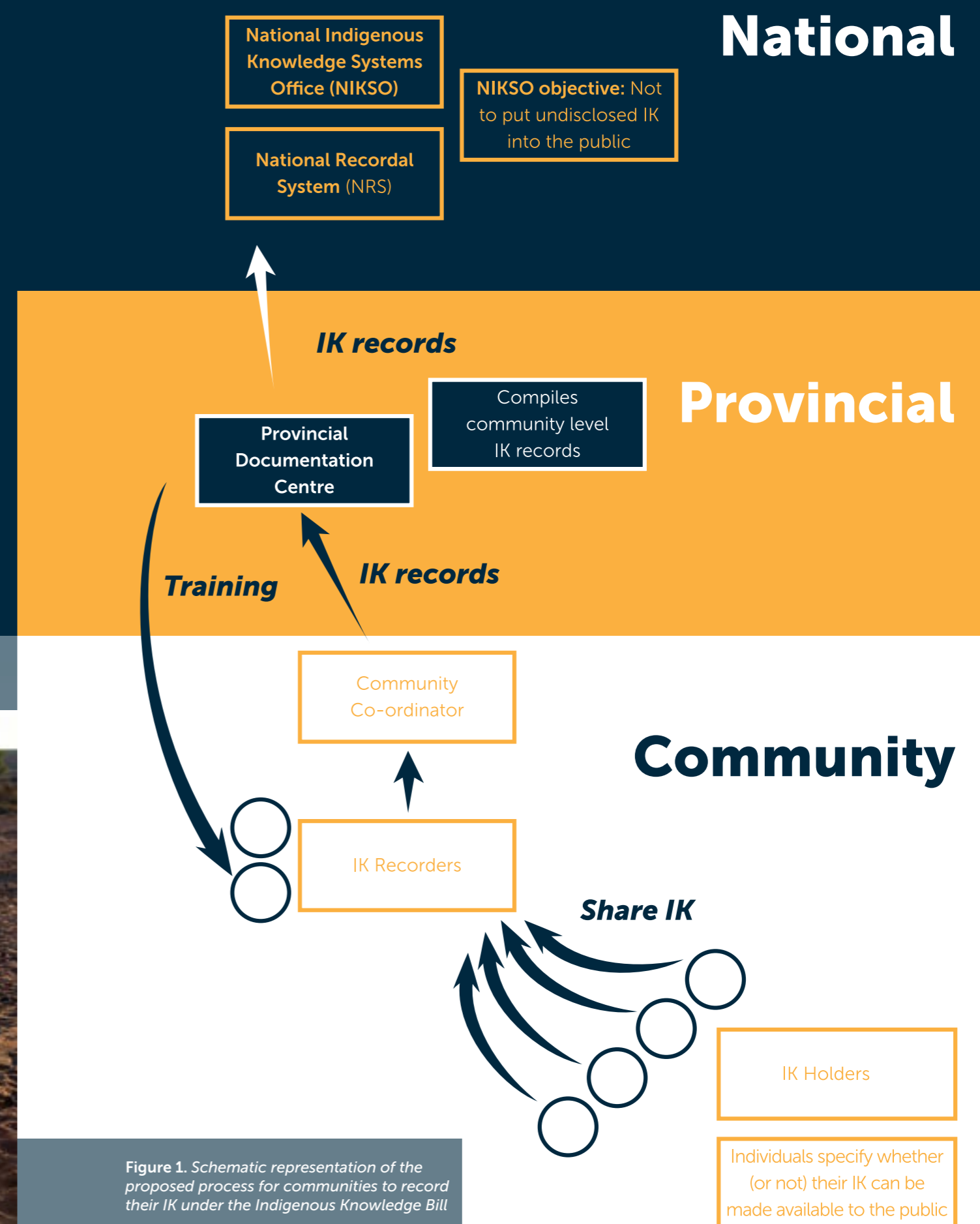
Figure 1. Schematic representation of the proposed process for communities to record their IK under the Indigenous Knowledge Bill